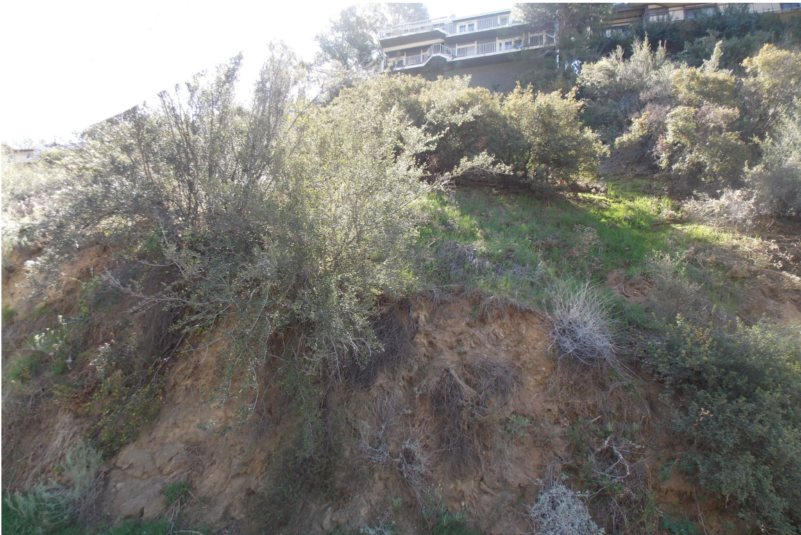
O. 437 NOLAN AVE (VIEW FROM VALENTINE RD)