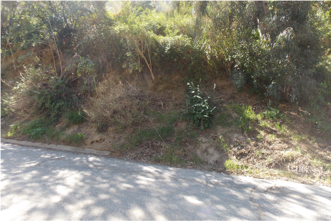
M. APN# 5630-022-007 (VIEW FROM NESMUTH RD)