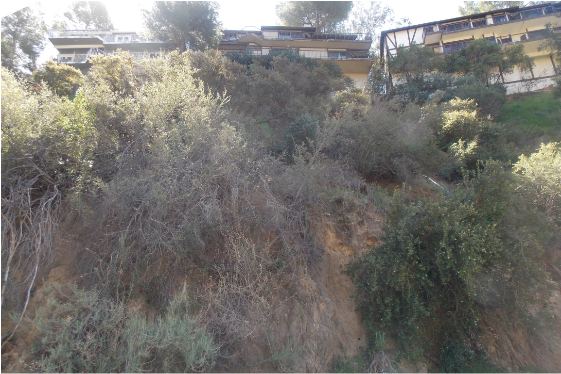
N. 441 NOLAN AVE (VIEW FROM VALENTINE RD)