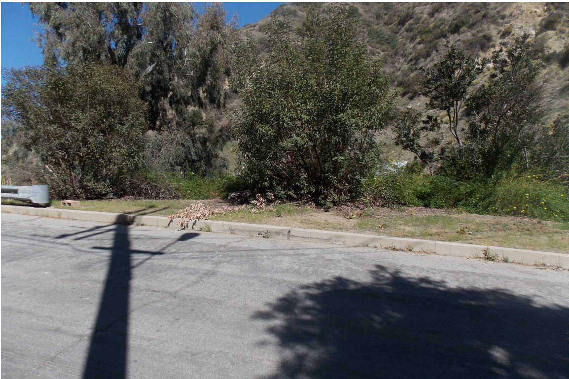
M. APN# 5630-022-007 (VIEW FROM VALENTINE DR)