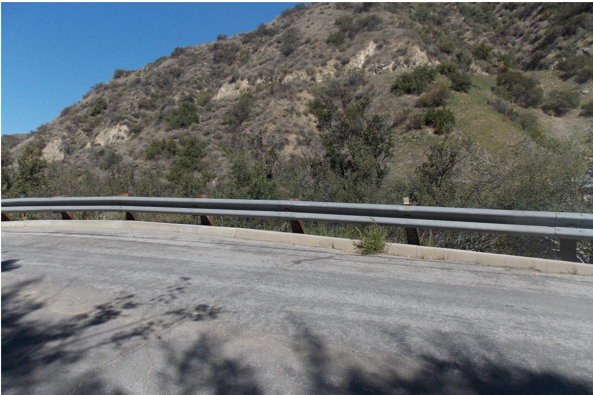
L. APN# 5630-022-901 (VIEW FROM VALENTINE DR)