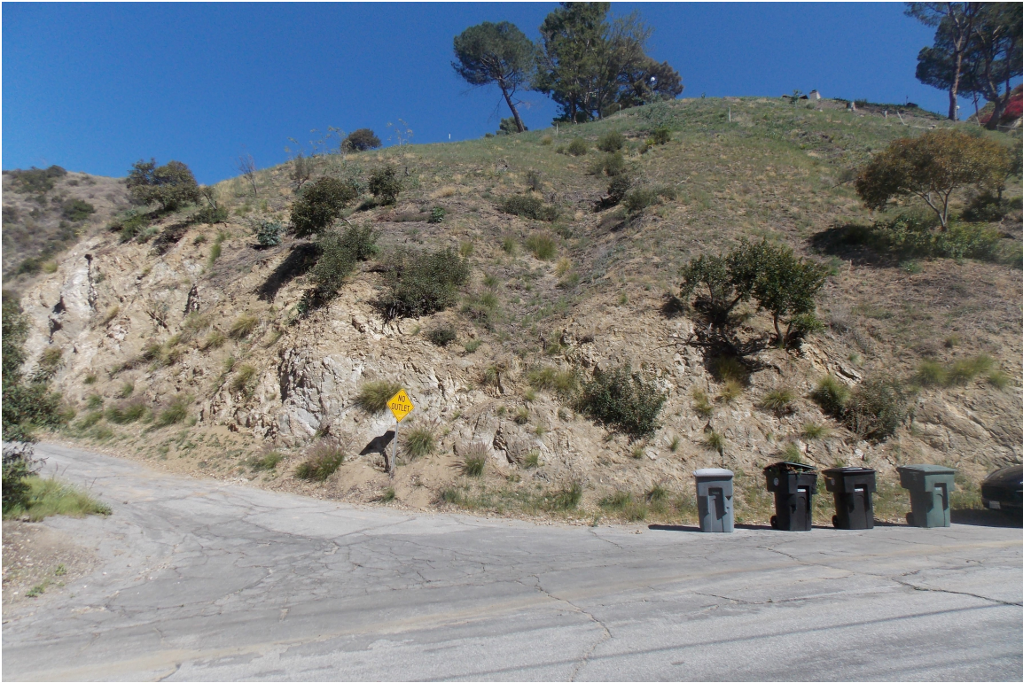
F. 419 CARDIGAN AVE