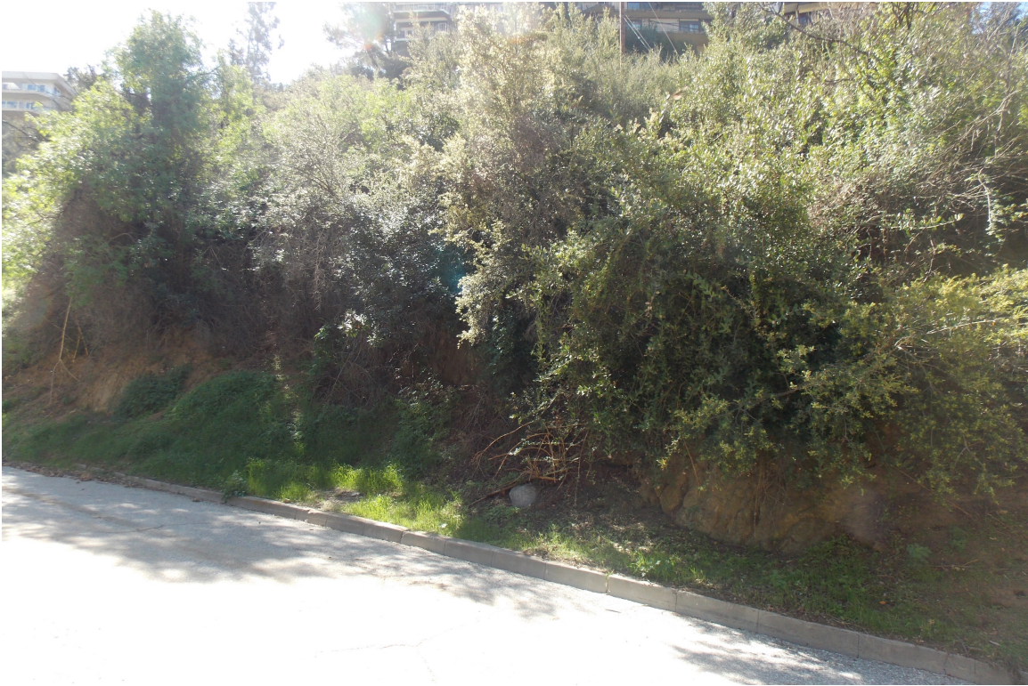
L. APN# 5630-022-901 (VIEW FROM NESMUTH RD)