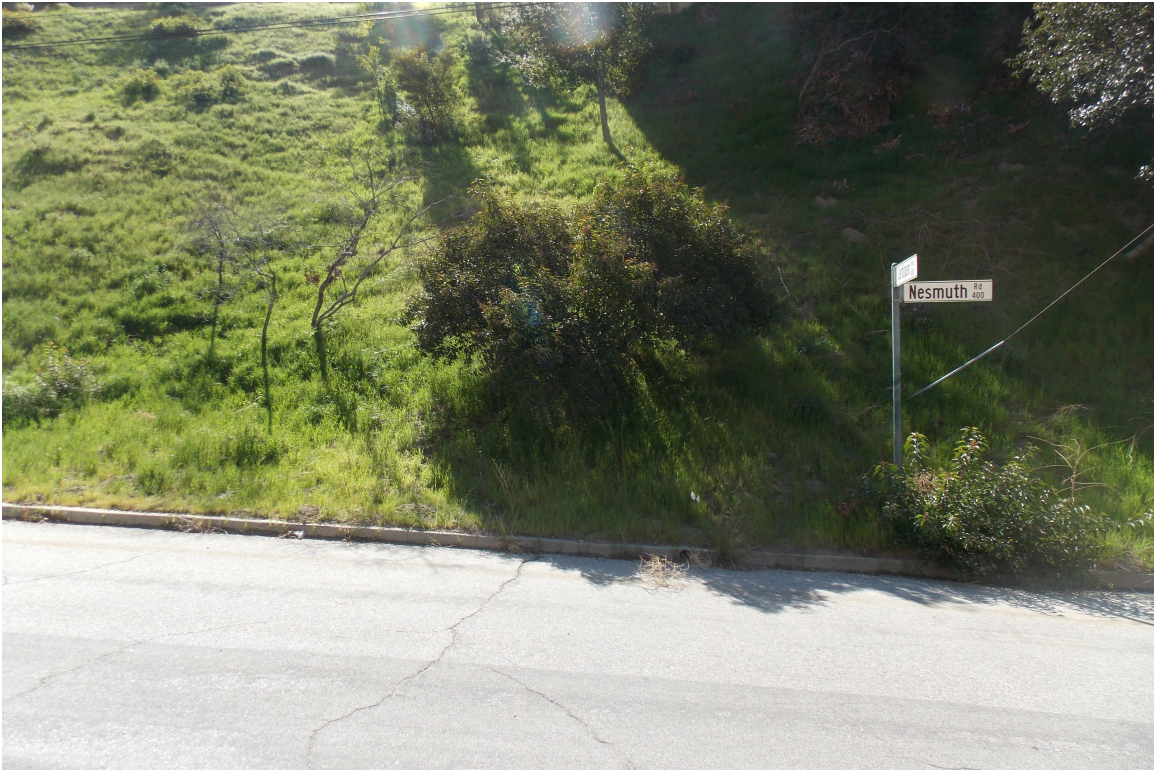
D. 397 NOLAN AVE (VIEW FROM NESMUTH RD)