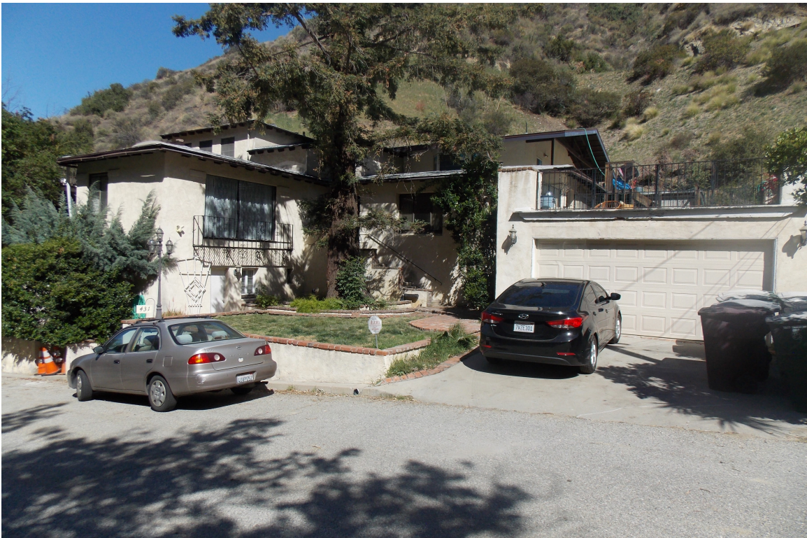
I. 431 NESMUTH RD