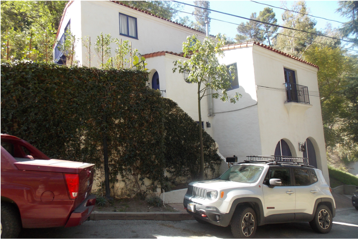
B. 412 NESMUTH RD